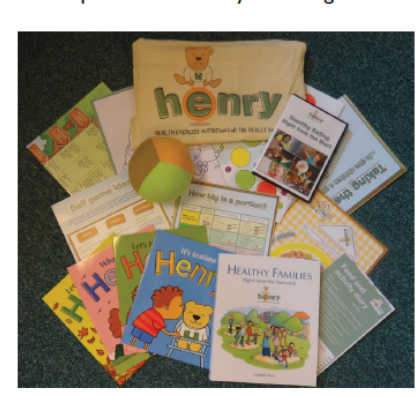
The HENRY Parent Toolkit - free to everyone joining a HENRY programme

The HENRY toolkit will help you give your child a great start in life, get the whole family involved, and keep track of how well you're doing.